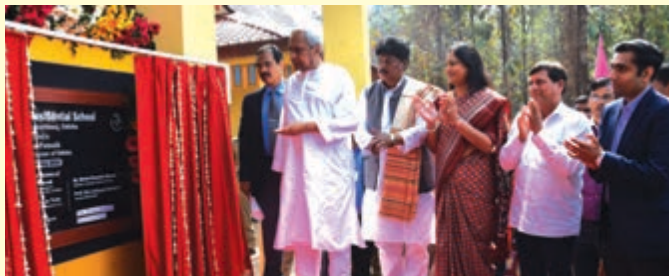
Shri Naveen Patnaik, Hon'ble Chief Minister of Odisha inaugurating Adani-KISS Residential School, Mayurbhanj on January 8, 2020.

KISS has been recognised as an internationally replicable model of empowerment of indigenous (tribal) people. A branch of KISS was started in Delhi in 2013. The State of Odisha has a high concentration of tribal population, constituting about one-fourth of the total population. Like the rest of the country, they lag behind the mainstream population in terms of education and other development indicators. In view of this, KISS had planned to start its satellite centres in 20 districts of Odisha. Five branches of KISS have already started functioning in Mayurbhanj, Balangir, Kalahandi, Balasore and Cuttack districts. Work has been completed in another four branches and they will soon become operational in Boudh, Kandhamal, Ganjam and Keonjhar districts. All remaining satellite centres will become functional by 2022. Work is also in progress to set up satellite centres of KISS in 10 states and 10 foreign countries.