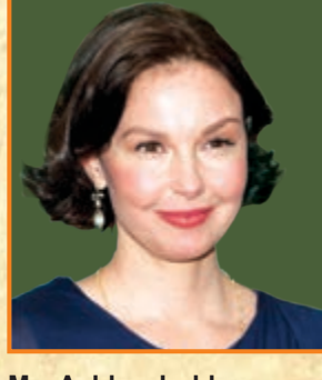
Ms. Ashley Judd, Hollywood Actor, Activist & Global Goodwill Ambassador, UNFPA (2016)