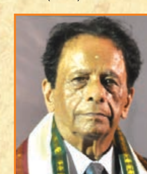
Rt. Hon. Sir Anerood Jugnauth, Eminent Social Worker & His Excellency the President of Mauritius (2010)