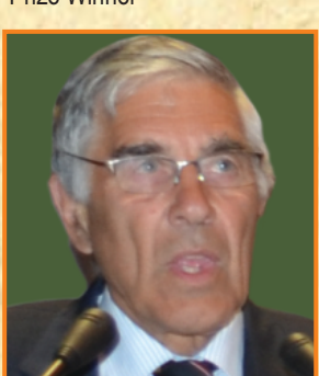
Rt. Hon. Lord Nicholas Addison Phillips, President (Chief Justice) of the Supreme Court of the United Kingdom (2011)