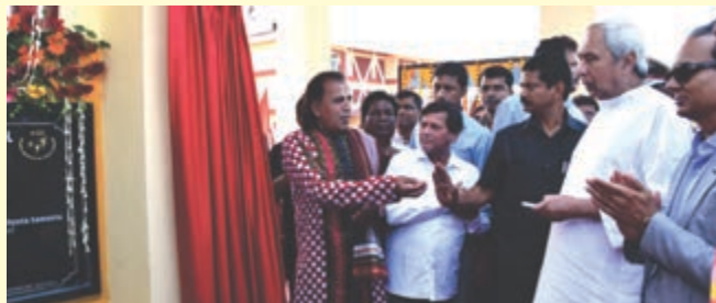
Shri Naveen Patnaik, Hon'ble Chief Minister of Odisha inaugurating Motilal Oswal-KISS Residential School, Bolangir on February 15, 2020.