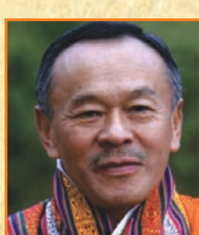
His Excellency Lyonchhen Jigmi Y. Thinley, Hon'ble Prime Minister, The Royal Government of Bhutan (2012)