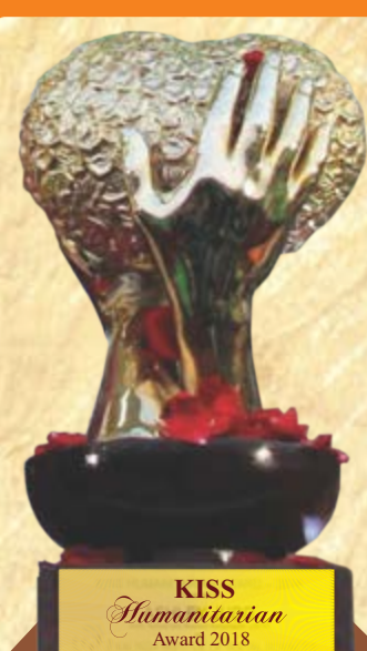
KISS Humanitarian Award Trophy

KISS Humanitarian Award is a celebration of the struggles of extraordinary human beings who try to alleviate suffering from the face of the earth.