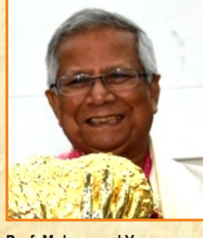
Prof. Muhammad Yunus, Founder of Grameen Bank, Bangladesh and Nobel Peace Prize Winner